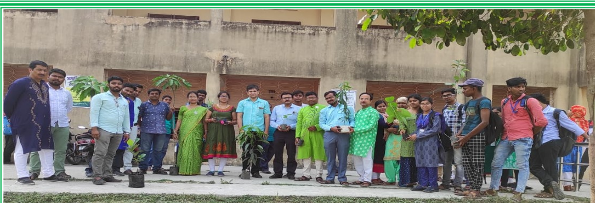
PLANTATION PROGRAMME IN WORLD EARTH DAY – 22.04.2022