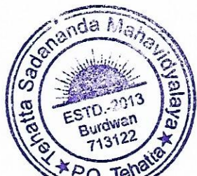
Principal Tehatta Sadananda Mahavidyalaya Tehatta, Purba Bardhaman

To avail the benefits of the scholarships/ freeships it is mandatory for the students to register through the online portal to upload the relevant documents. Students must login at respective portals and see the eligibility criteria and documents essential for the scholarship or freeship. The notice regarding filling up of form for particular scholarship or freeship get displayed on notice board as well as on website. Students should fill the online form from above mentioned website and take print out of the form.