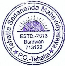
Principal Tehatta Sadananda Mahavidyalaya Tehatta, Purba Bardhaman

Student Aid Funds is basically provided by colleges itself and are typically financial resources allocated to assist students in meeting their educational expenses. These funds might come from various sources, including government grants, endowments, alumni donations, and institutional budgets.