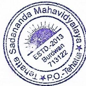
Principal Tehatta Sadananda Mahavidyalaya Tehatta, Purba Bardhaman

& C I HCC Principal St. Xavier's College St. Xavier's Road Burdwan-713103