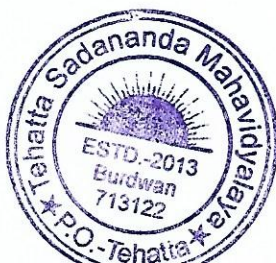
Principal Tehatta Sadananda Mahavidyalaya Tehatta, Purba Bardhaman