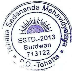
Principal Tehatta Sadananda Mahavidyalaya Tehatta, Purba Bardhaman