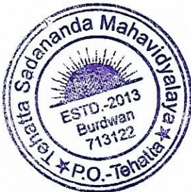
Principal Tehatta Sadananda Mahavidyalaya Tehatta, Purba Bardhaman

Gender equity refers to the concept of fairness and justice in the distribution of resources, opportunities, and responsibilities between individuals of different genders. Achieving gender equity involves recognizing and addressing historical and societal inequalities that have led to disparities in various aspects of life, including education, employment, healthcare, and representation.