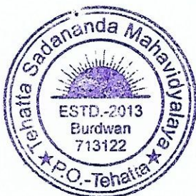
Principal Tehatta Sadananda Mahavidyalaya Tehatta, Purba Bardhaman

The College is utilizing the benefits of NPTEL local chapters an online Learning Initiatives by IITs and IISc.